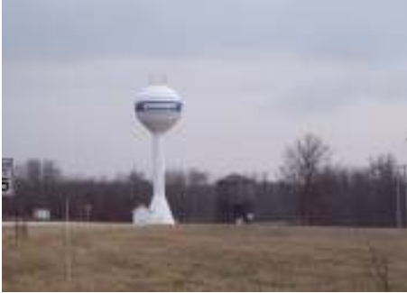
QUALITY ON TAP

PRESORTED STANDARD U.S. POSTAGE PAID SPRINGFIELD, IL PERMIT NO. 500